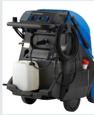
All key functions placed for optimal ease-of-use.