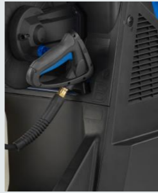
Unique holder prevents spray gun from falling on the ground when the washer is used or moved.

The 4 wheel concept with larger wheel diameter and sweight balance mean that the MH 3M and 4M models provide optimal manoeuvrability over all types of surface – reducing the effort needed by the user to reach their cleaning site.