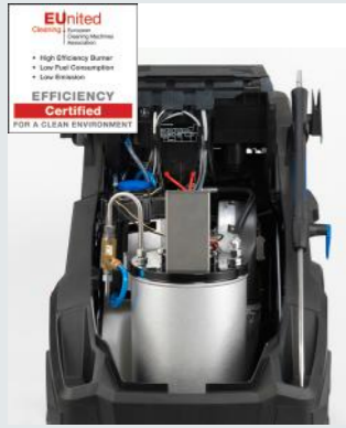
The EcoPower boiler provides high efficiency and low fuel consumption – approved by EUnited.