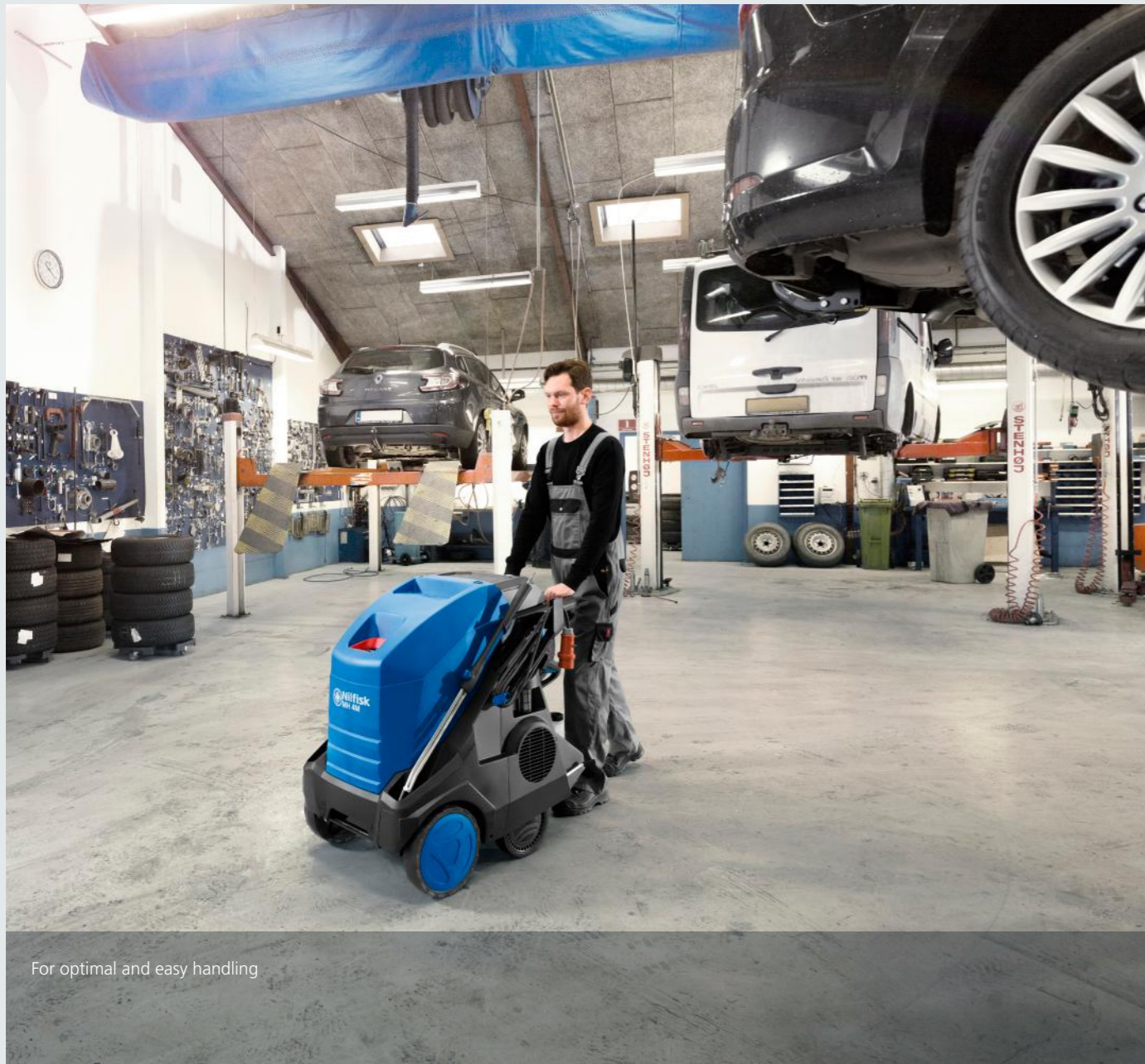
For optimal and easy handling

The 4 wheel concept with larger wheel diameter and sweight balance mean that the MH 3M and 4M models provide optimal manoeuvrability over all types of surface – reducing the effort needed by the user to reach their cleaning site.