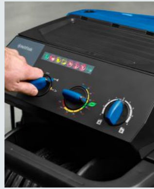
Control panel with safety indications.